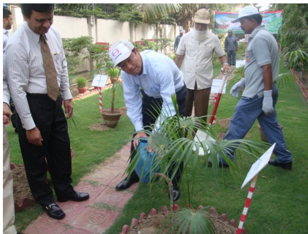
Group Photograph on the occasion of Tree plantation

This year World Environment Day was celebrated on Monday June 6 th , 2011. The day began by conducting a symbolic tree plantation ceremony at Head Office lawn. This was attended by our Top management, indicating their commitment towards environment