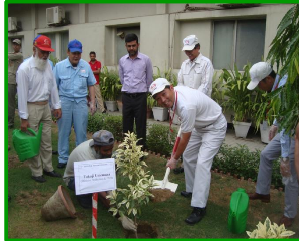
Group Photograph on the occasion of Tree plantation