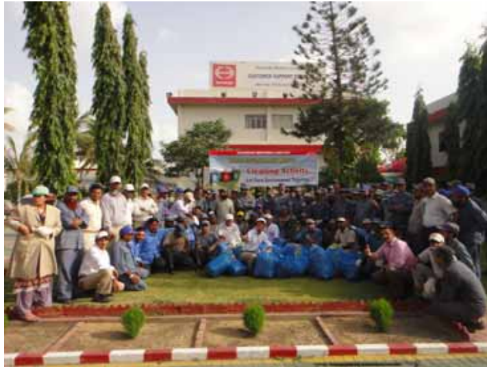
Group Picture HPML Employees & S.I.T.E Model School Children & School Staff