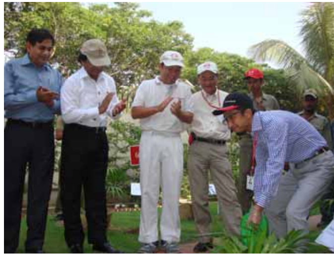
Group Photograph on the occasion of Tree plantation