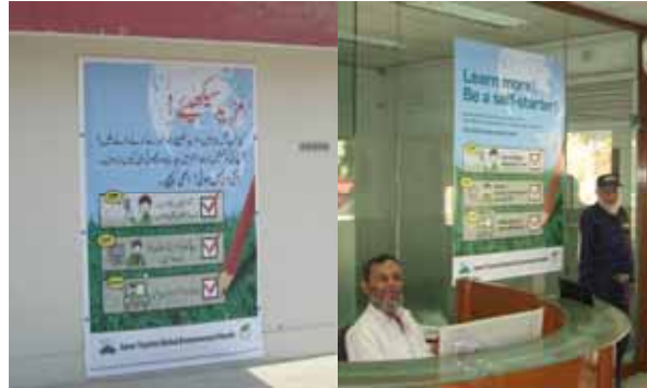
World Environment day and Month